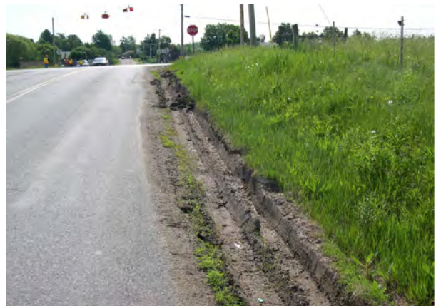
VT 73 West Class II State Numbered Town Highway