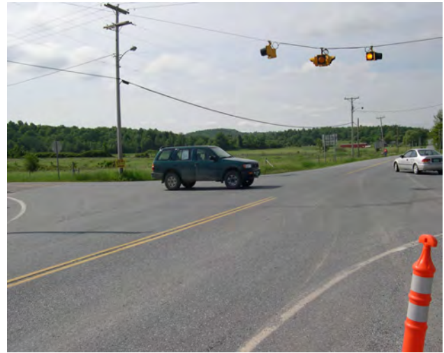
VT 22 A North