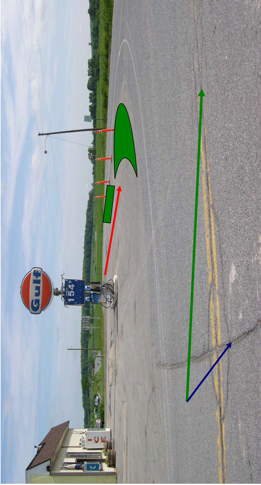
VT 22A North @ VT 73 State Numbered Town highway