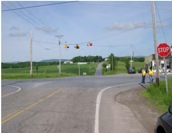
VT 73 East