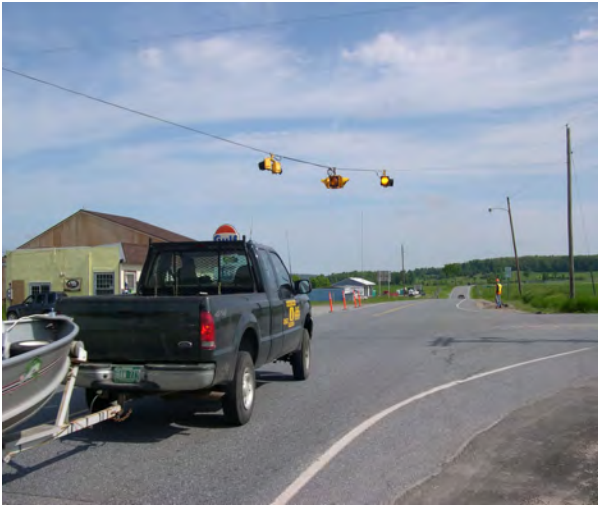
VT 22 A South